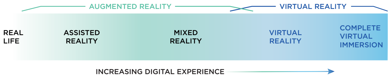
FIGURE 1: There are a variety of technologies offering different proportions of reality vs. virtuality on the technology continuum.

Assisted Reality (AR) smart glasses deliver information through the glasses that augments the user's field of view. Most are monocular, displaying text or information to just one eye. Users typically use voice commands, a touchpad or handheld controls to interact with the smart glasses.